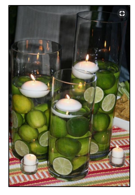
Limes in a glass vase with floating Candle!