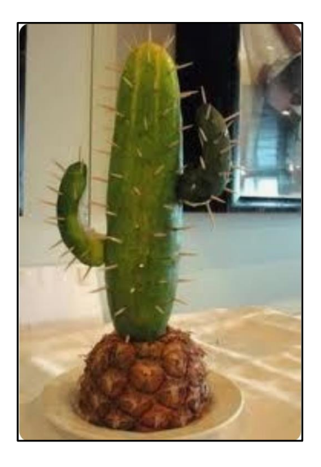
Cactus Cucumber and Pickles on a Pineapple base!